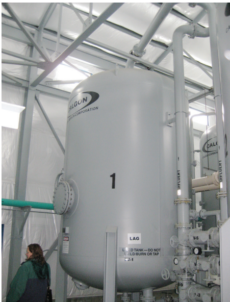
Village of Russells Point Water Quality Improvement

Communities receive grants up to $750,000 to improve the safety and reliability of drinking water and sanitary sewer systems. Up to $100,000 of the award may be used for on-site improvements.