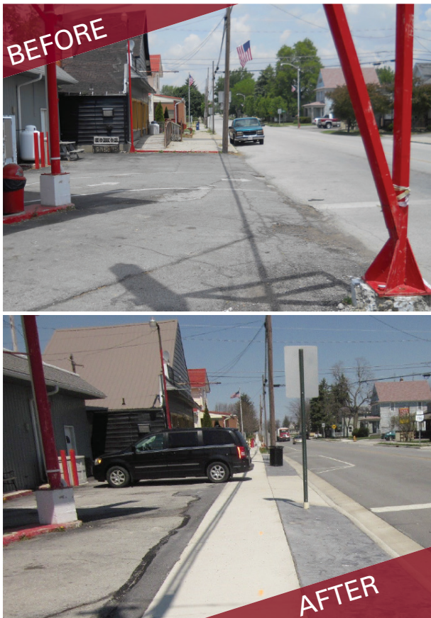
Village of Waynesfield Street Replacement

The Office of Community Development will consider other housing activities for communities that submit fundable Community Housing Impact and Preservation (CHIP) Program applications that do not score high enough to receive funding.