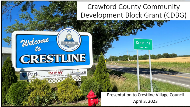
Crawford County Community Development Block Grant (CDBG)