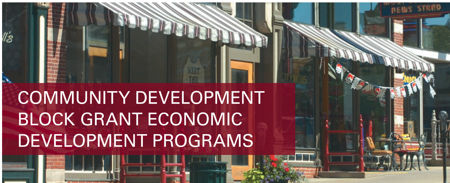
Main Street, Mansfield, Ohio