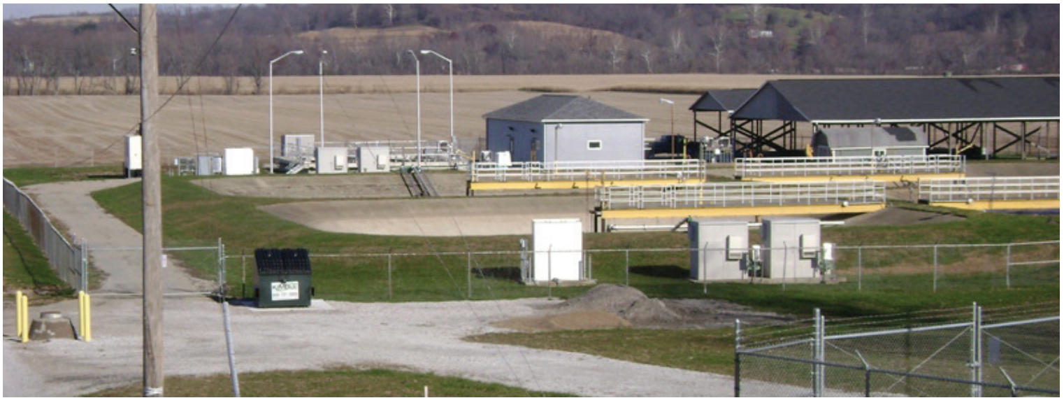
Village of West Lafayette Wastewater Treatment Plant Expansion