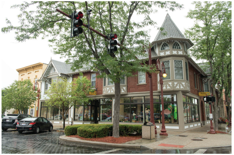
Art Crest Building, Maumee, Ohio